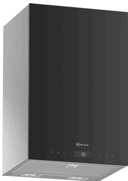
N 90, Wall-mounted cooker hood, 33 cm, Black D35KHV2S0B